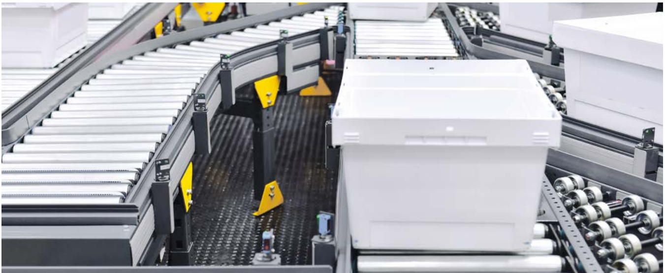
Standardized plastic RTIs enable integration into automated processes, e.g. at the conveyor belt.

Plastic RTIs with RFID labels – Plastic crates are the most wide-spread option for a large number of applications and industries, to transport, handle and store many kinds of product. UHF RFID labels are perfect for plastic crates. They are highly resistant to external influences and harsh environmental conditions. As the optimal solution for tracking returnable plastic crates and pallets, these special RFID tags are designed to withstand multiple washings while providing companies with a cost-effective solution that increases efficiency, reduces inventory shrinkage, promotes sustainability and streamlines their delivery processes.